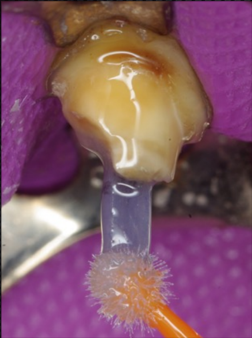
Apply bonding agent/adhesive