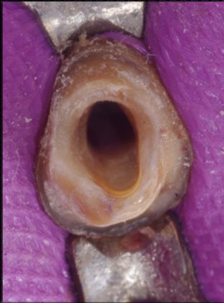
Prepared post space