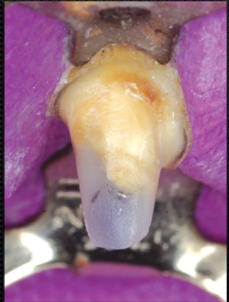
Place & cure core composite