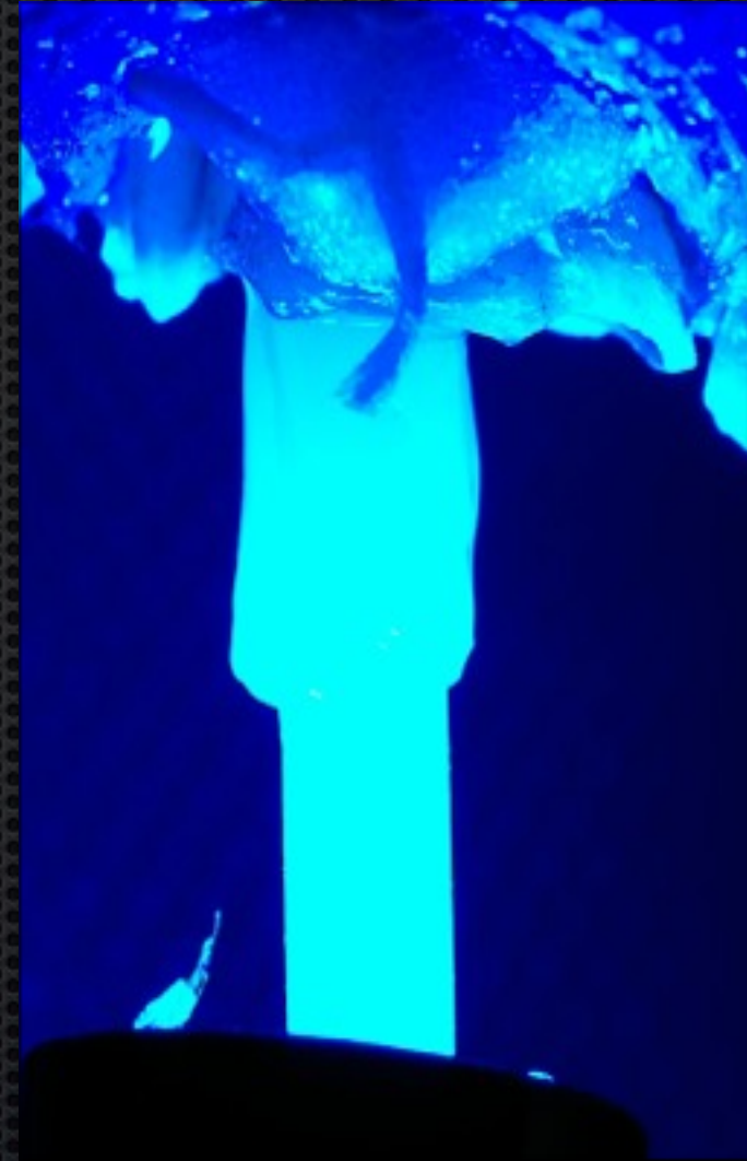
Light-cure the cement