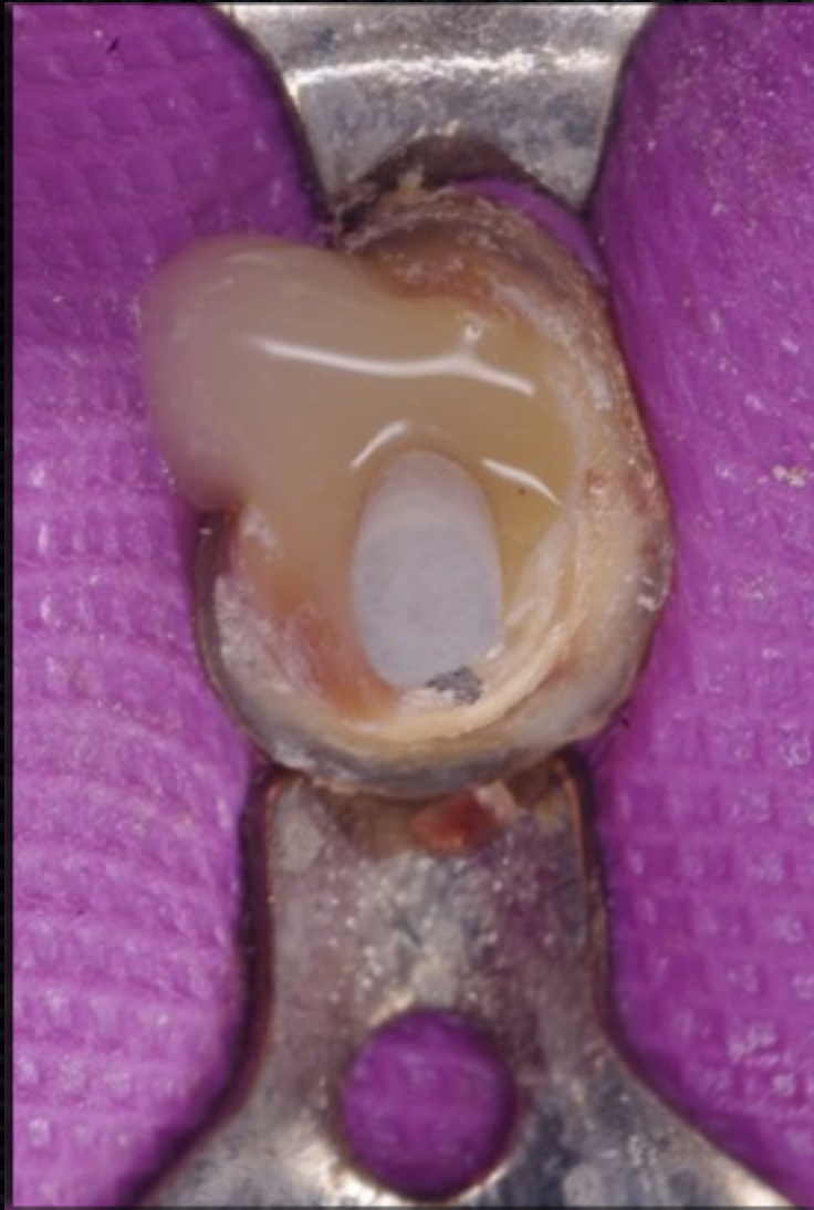
Place cement and then post