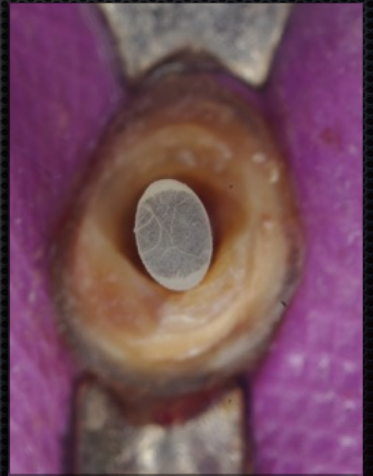
Try - in Oval Post