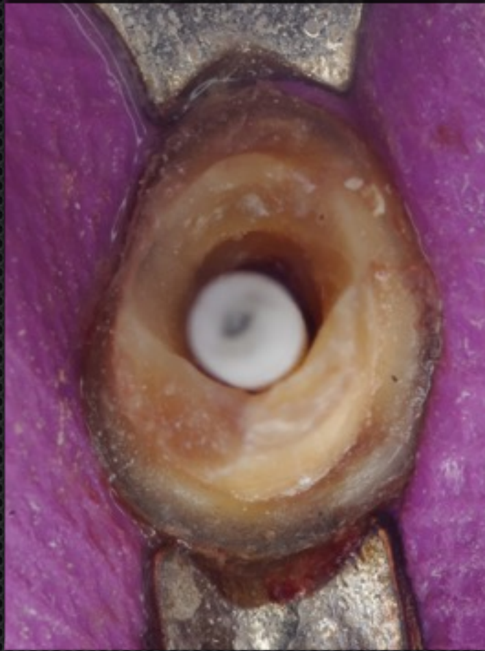
Round post does NOT FIT